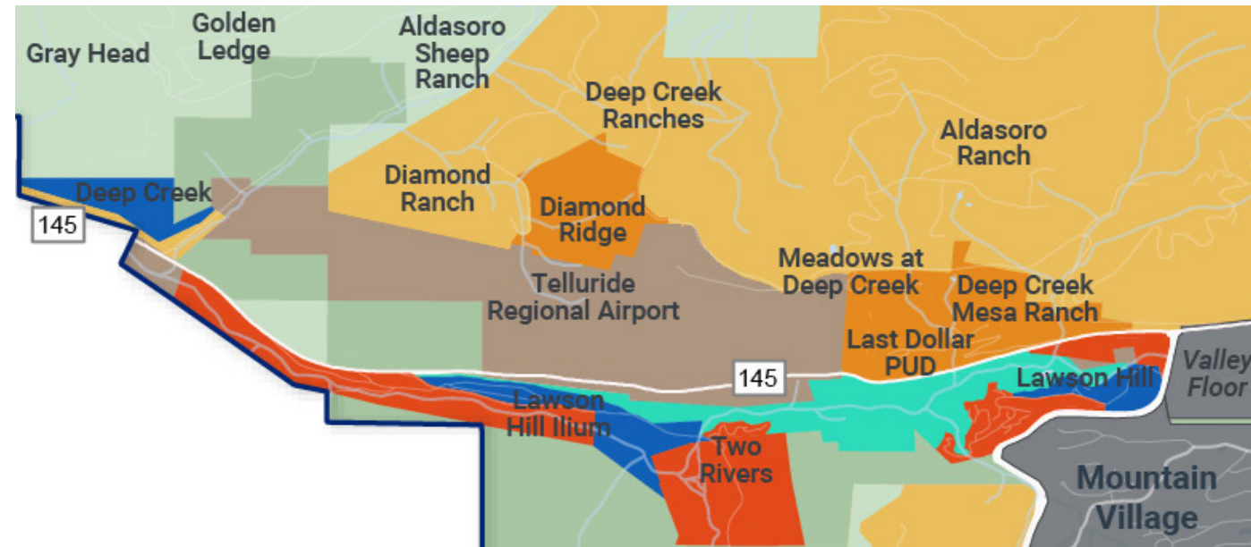
Map 9: San Miguel County East End Future Land Use Map, Lawson Hill and Surrounding Areas.

existing conditions and trends analysis, and community feedback, the following future land use categories are identified for the east end. These categories are described in more detail in the following pages.